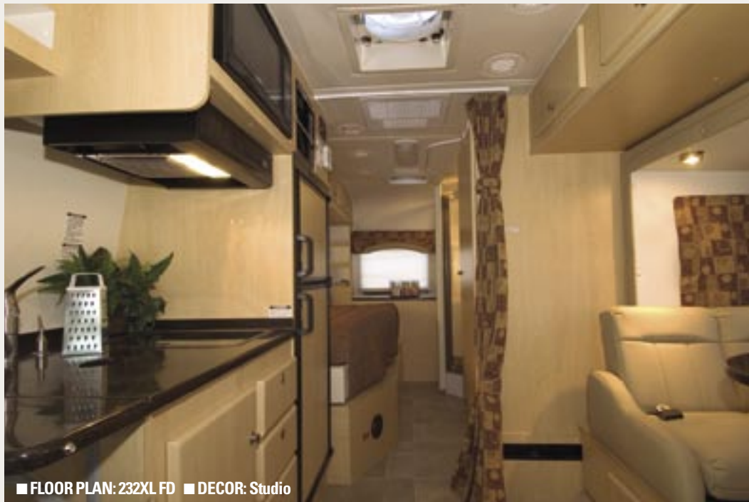
■ FLOOR PLAN: 232XL FD ■ DECOR: Studio

The Platinum 232XL is available in two well-thought-out floor plans, a Front Dinette (which can be converted to a twin bed) and a Front Sofa (with a motorized sofa that folds down into a double bed).