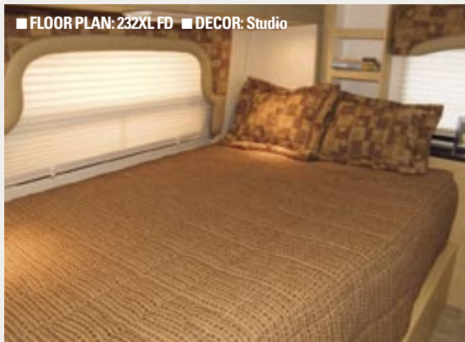
■ FLOOR PLAN: 232XL FD ■ DECOR: Studio

ABOVE: View to the rear shows permanent double bed (left) and bathroom. Kitchen and dinette are in the front of the coach.